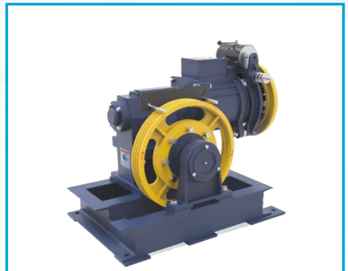
GEARED MACHINE 1.0MPS