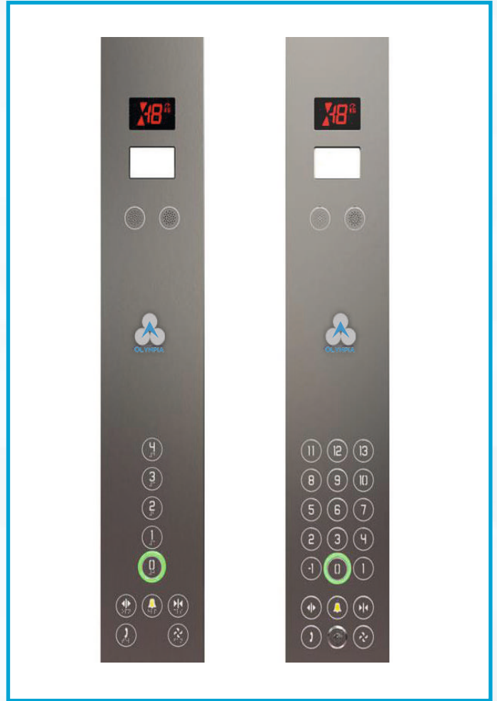
CAR OPERATING PANEL