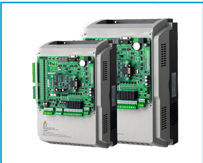
SERIAL LINK CONTROLLER